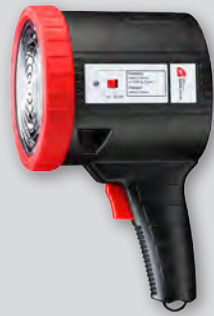
Safe-Area Test Lamp