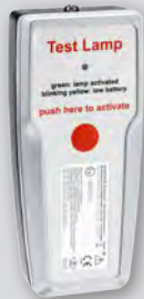
Intrinsically Safe Test Lamp